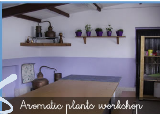
Aromatic plants workshop