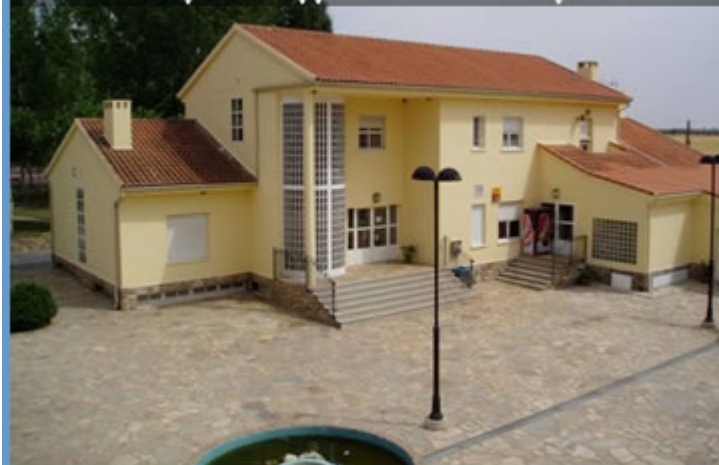
Building 1. Office & Dining rooms