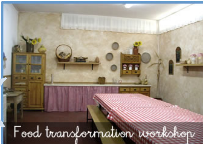
Food transformation workshop