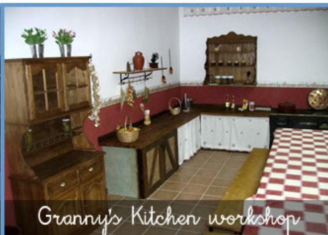
Granny's Kitchen workshop