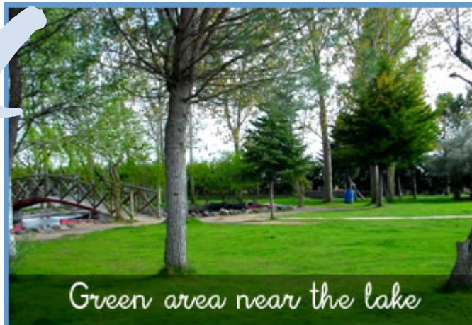
Green area near the lake